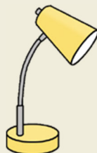
Light Lamp or window