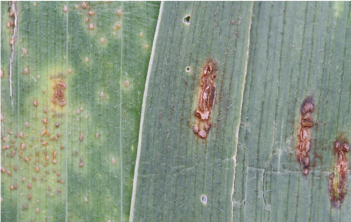
Fig. 1. Pustules of southern rust, caused by Puccinia polysora (left side of photo), in comparison with common rust pustules, caused by Puccinia sorghi (right side of photo). Common rust is seen on foliage early in the season, but its development is hindered by high temperatures, while the amount of southern rust increases over the growing season, if warming temperatures occur with frequent rain or heavy dews.

The purpose of a fungicide application is to protect the upper leaves of the plant during the period of kernel development. If it is applied too early (e.g. the vegetative stage), it may not protect the critical leaf tissue and another fungicide application may be necessary. Since all fungicides work by preventing pustule development in some manner, they need to be applied before a significant amount of disease is showing in the upper leaves. The benefits of a fungicide application will be affected by hybrid susceptibility, timing of infection, and environmental conditions that support disease development. A late-planted, highly-susceptible hybrid in a growing season with frequent rain showers is at highest risk from severe disease development and will probably benefit from a fungicide application.